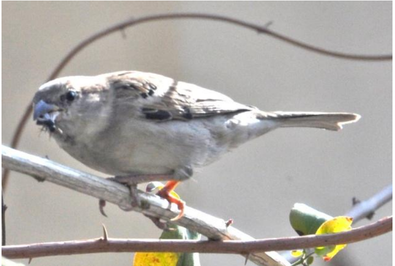
House Sparrow (Female) Feeding