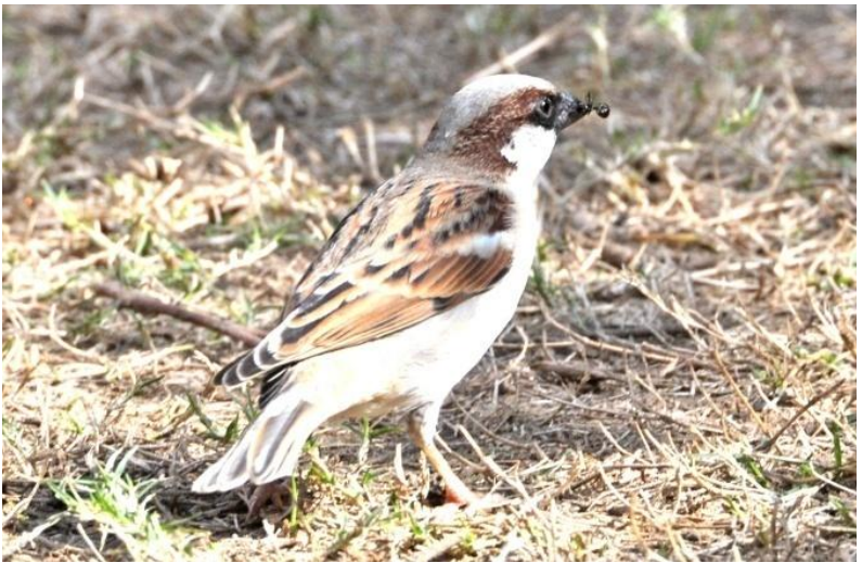
House Sparrow (Male) Feeding