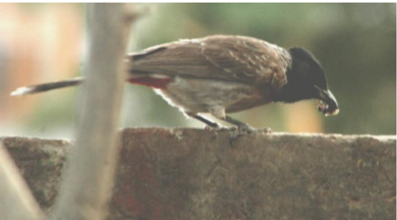
Red-vented Bulbul Feeding

There are two contrasting views regarding feeding strategies of insectivorous birds: they may be opportunistic feeders and exploit patchy insect aggregations (Gould 1978; Fenton and Morris 1976) or may be non-opportunistic and select from among available insects (Whitaker 2004; Brigham 1990). The birds seems to belong more likly to the first group. Although ants reported in the diet of Indian Robin but ant alates not comprise the majority of its diet.